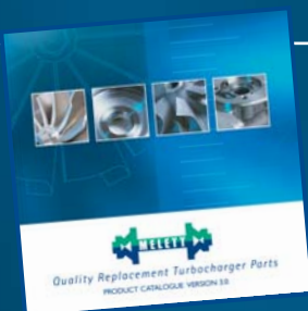
New Catalogue and website