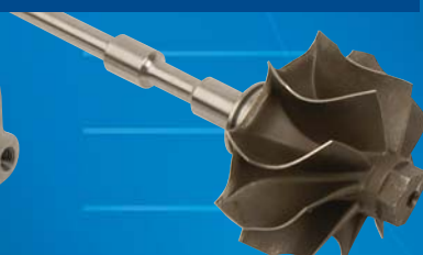
GT/VNT 15/17/18 Shaft and Wheels