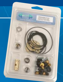
Repair Kits Explained