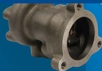
K03 and K04 Turbine Housings